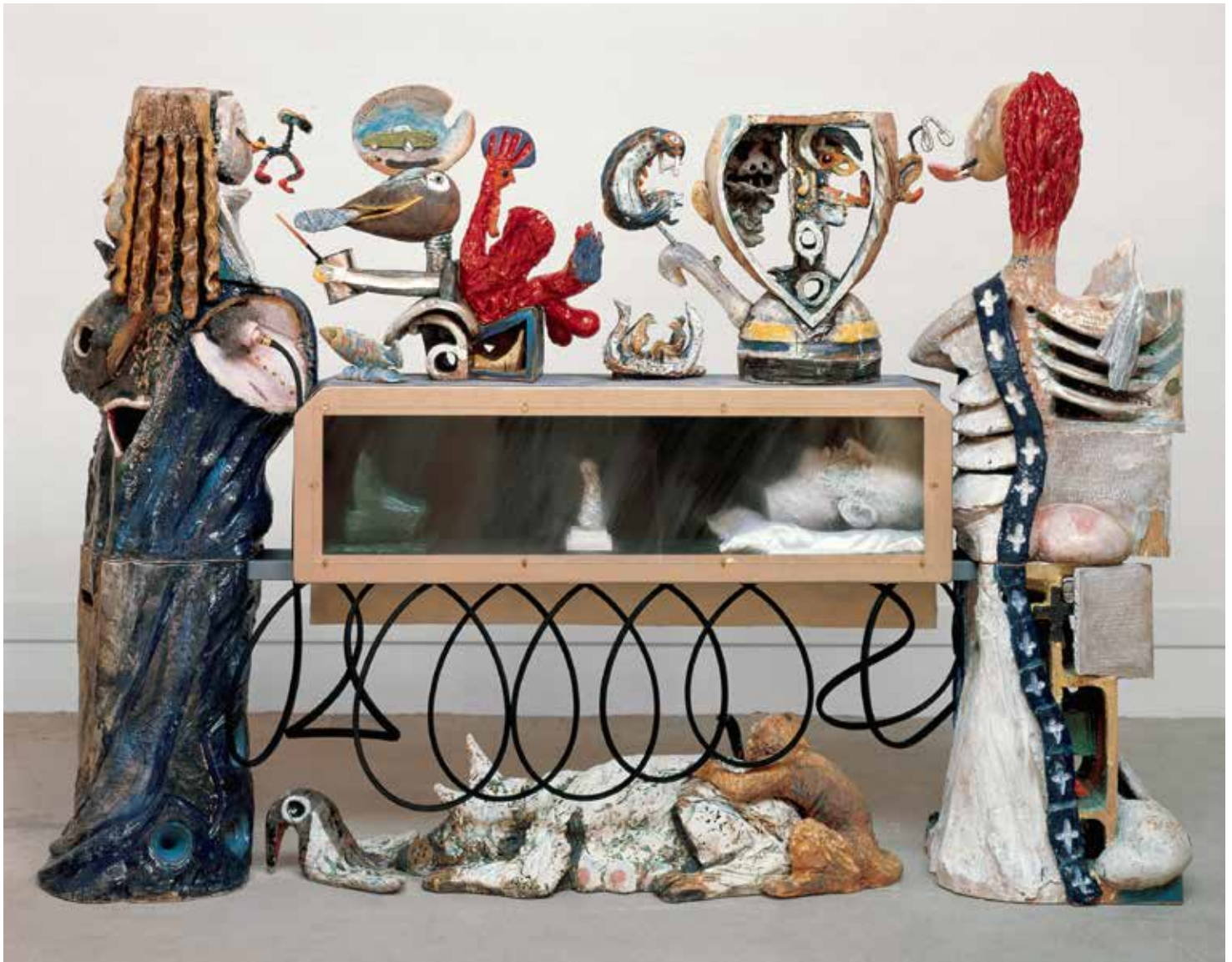
Robert Arneson, Guardians of the Secret II , 1990 (rear view)