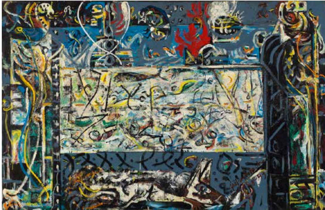
Jackson Pollock, Guardians of the Secret , 1943

Guardians [II] has so much going on that I am willing to call it my masterpiece... Pollock's work is so open to interpretation. It's inviting. It has hundreds of symbols. You can stare, focus, sketch it out, render, make a few little attempts at transference from two to three dimensions, and see what happens. You have to enter into the spirit of the work.