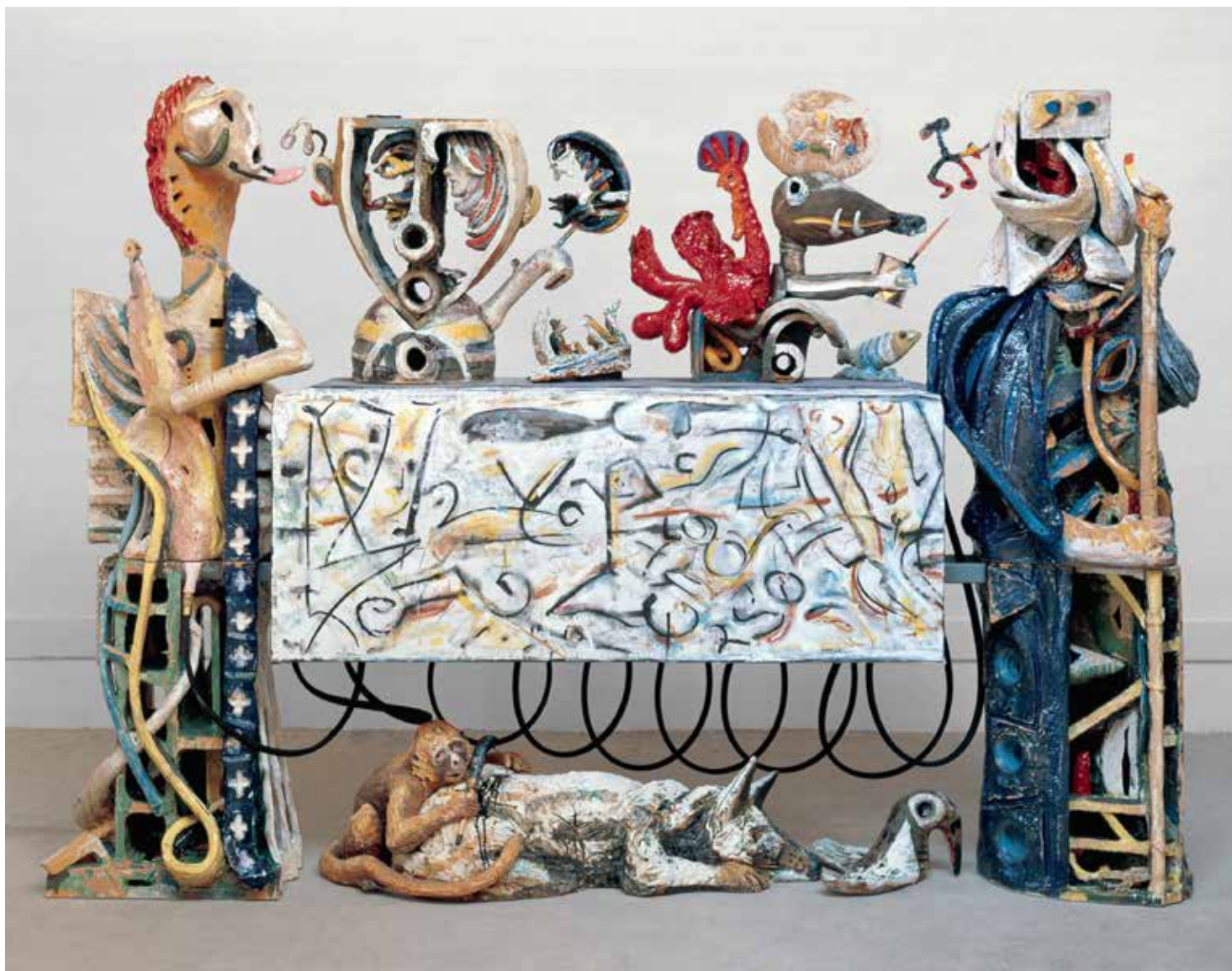
Robert Arneson, Guardians of the Secret II , 1990